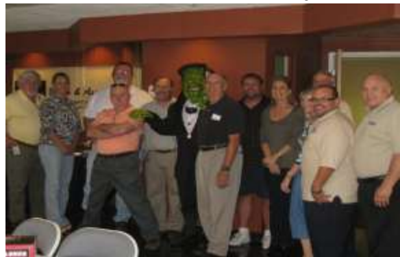
Some members of the AZBO Planning Committee