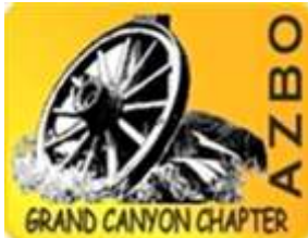
Grand Canyon Chapter Chair - Jack Judd

The next Grand Canyon Chapter meeting will be January 19 th in Bullhead City.