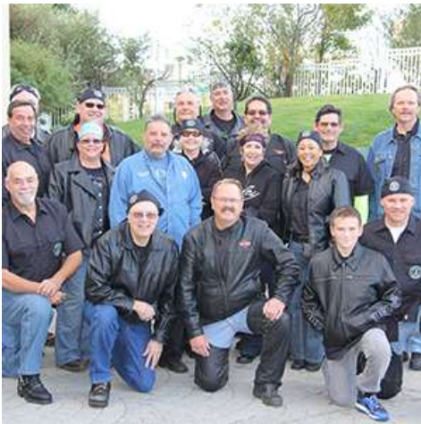
Annual Fowler Ride

an issue there is an opportunity for Code of Honor scholarships through the ICC, and some of the serving positions within AZBO also provide for this (my shameless plug to ask for service). I hope to see some new faces in Ft. Lauderdale next year. Start planning now!