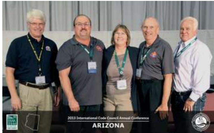
Arizona State Delegates