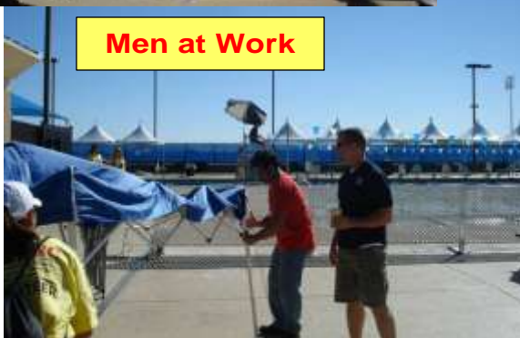
Men at Work