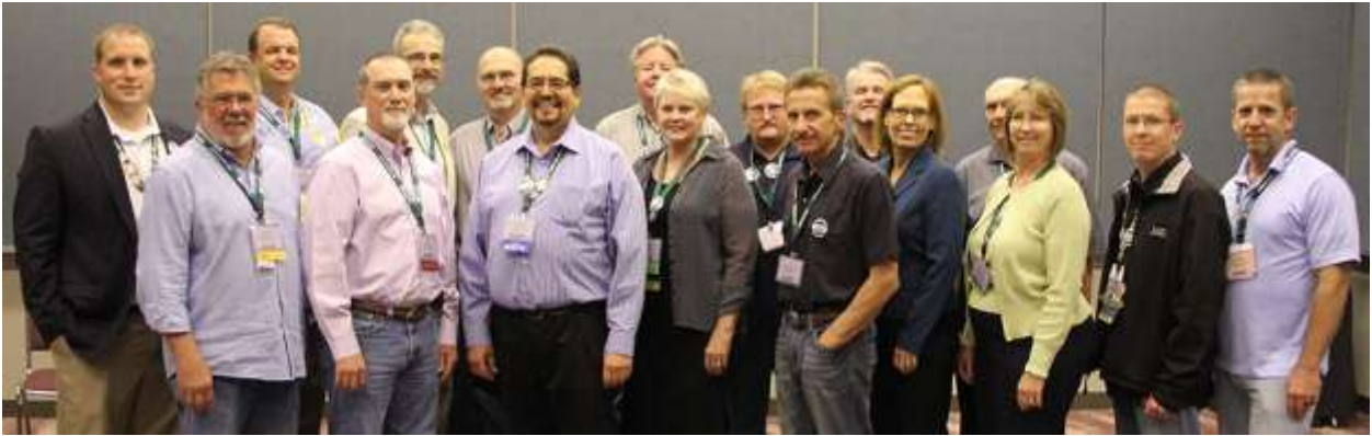
ICC Rocky Mountain Region XI: Arizona, Colorado, New Mexico and Utah

Seven resolutions were brought forward, and though all of them were important, the one I want to emphasize is to move the code cycle to a 6 year cycle. Arguments were presented both for and against.