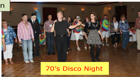
70's Disco Night