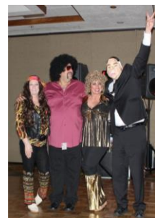
Costume Contest Winners