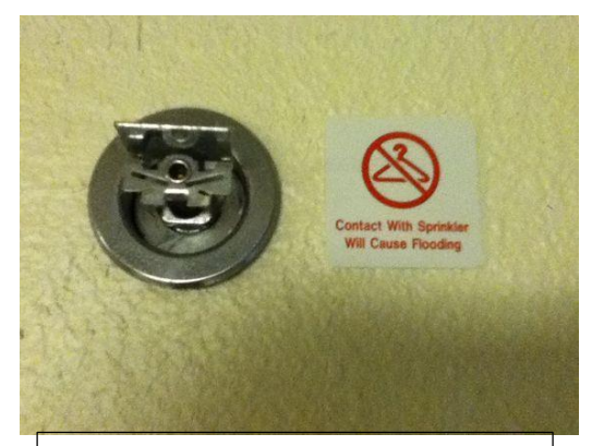
You know somebody did it or they would not have made a 'warning sign'.