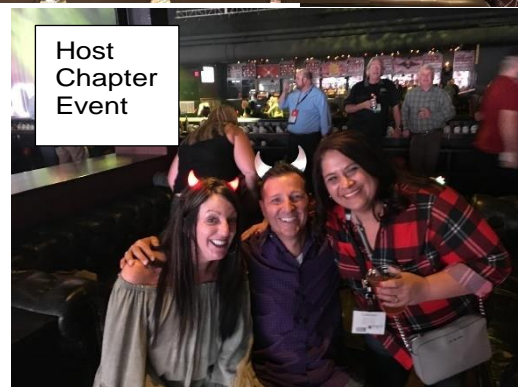
Host Chapter Event