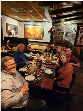
Fun times with co-workers and former co-workers