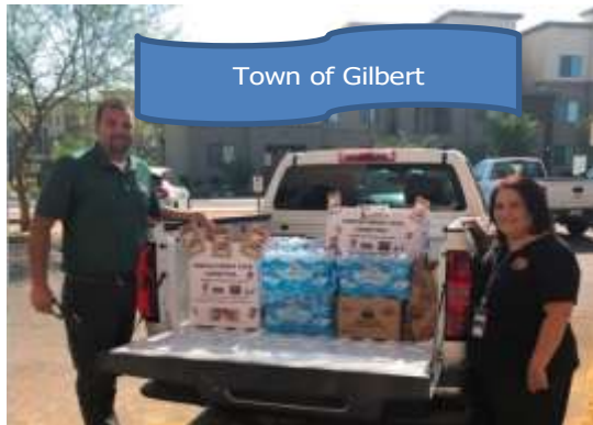
Town of Gilbert