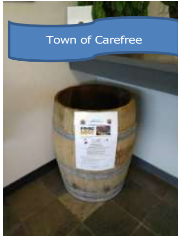
Town of Carefree