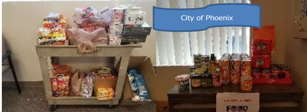
City of Phoenix