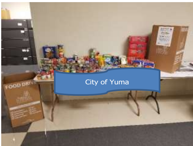
City of Yuma