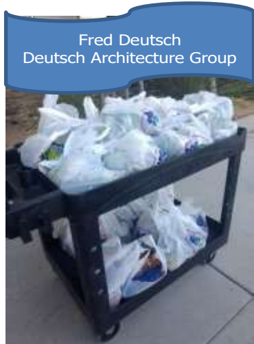
Fred Deutch Deutch Architecture Group