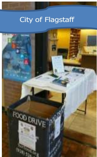
City of Flagstaff