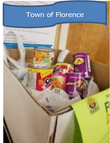
Town of Florence