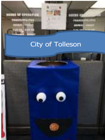
City of Tolleson