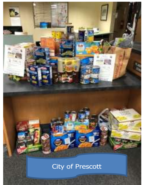
City of Prescott