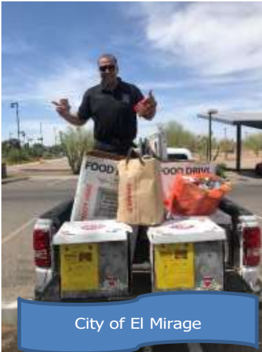
City of El Mirage