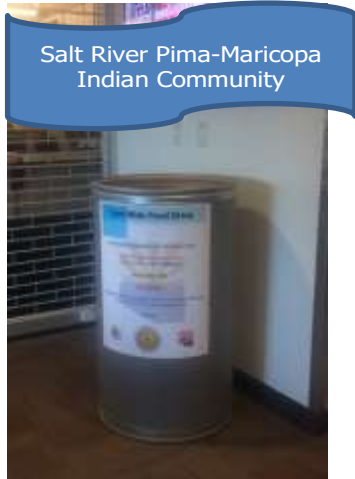
Salt River Pima-Maricopa Indian Community