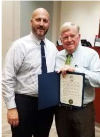
Town of Marana Proclamation The Town also provided weekly updates posted to their website