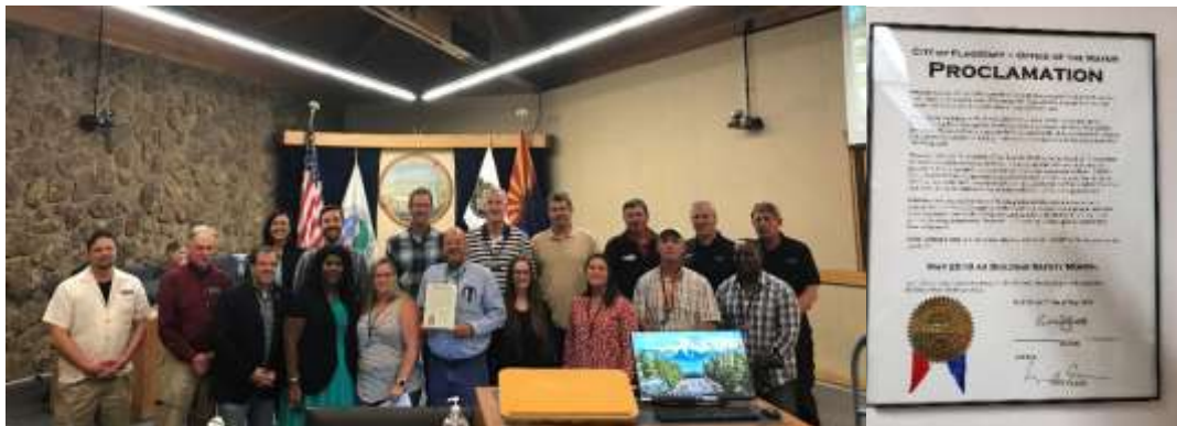
City of Flagstaff Proclamation