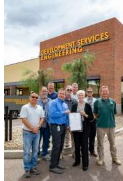
City of Goodyear Proclamation