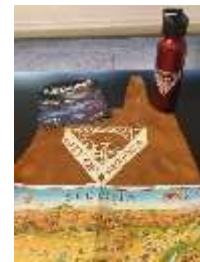
City of Sedona Swag Bag