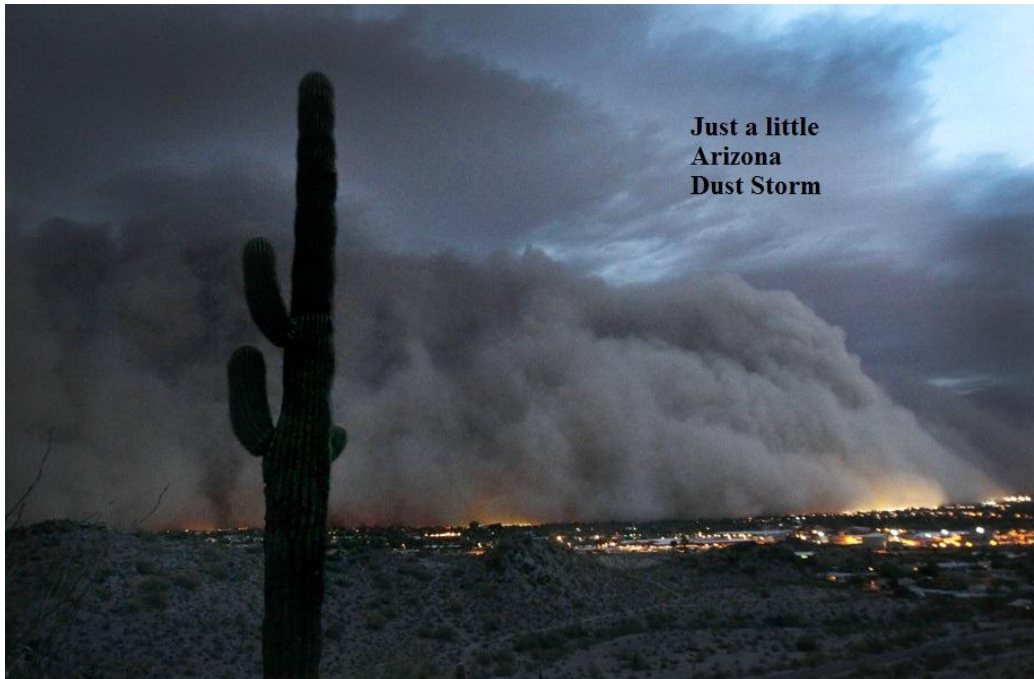
Just a little Arizona Dust Storm